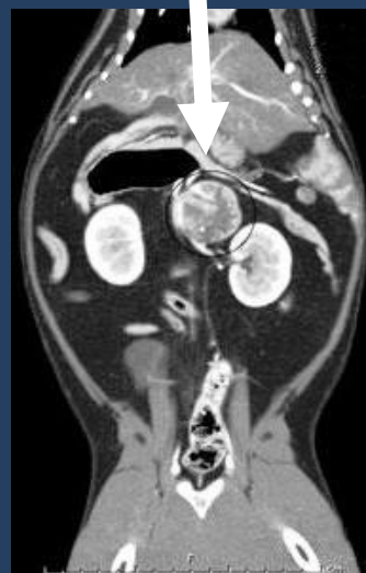
Left Adrenal Mass