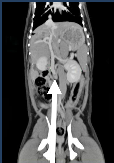
Aberrant vessel (portosystemic shunt)